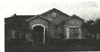
April 107 Randon Terrace