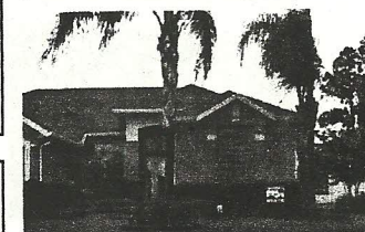
June 167 Randon Terrace

Email Address? Please help us in creating a Manderley email database - we need to communicate in a more efficient manner! We are also interested in creating a Manderley website - Send your email address to CRSWARE@aol.com , subject line: Manderley - Note: database will be confidential and email will not reveal other addresses.